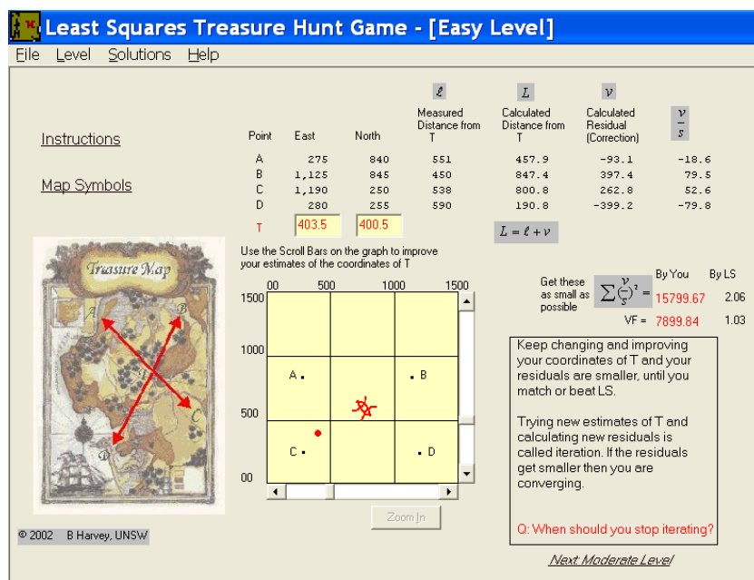
Figure 1. Screen image of Easiest level of game

The main design elements required were: motivation of students, students to do things not just reading, the game should give feedback, and encourage reflection by the students. The game challenges students to a competition; they estimate and enter coordinates, see changes in numbers and graphs and are asked questions that encourage reflection. Teachers sometimes have to motivate students who want to gain the skills, experience and understanding but don't want to do the work involved. By including enjoyment, enthusiasm and motivational aspects in this game students may choose to learn more about LS. Figure 1 is a screen image of one of the sheets in the game.